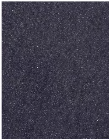
MY FAVOURITE SHOE